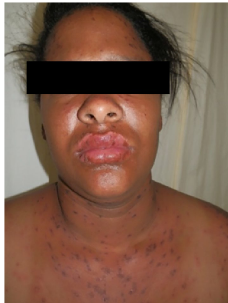
Fig. 1 Rash distribution similar to that published by McKinley et al. Relative sparing of areas covered by a brassiere

We propose that some of the areas that were relatively spared represent areas of increased local pressure on the skin rather than photo-induced or aggravated pattern. We have often seen the pattern illustrated in the images published by McKinley et al. in our SJS/TEN patients. We usually interpreted these as areas of relative sparing due to pressure from clothes and/or from prolonged anatomical positions that patients assume during the early stages of an evolving SJS/TEN. We reviewed SJS/TEN cases in our Immune Mediated Adverse Reactions in Africa (IMARI-Africa) database,