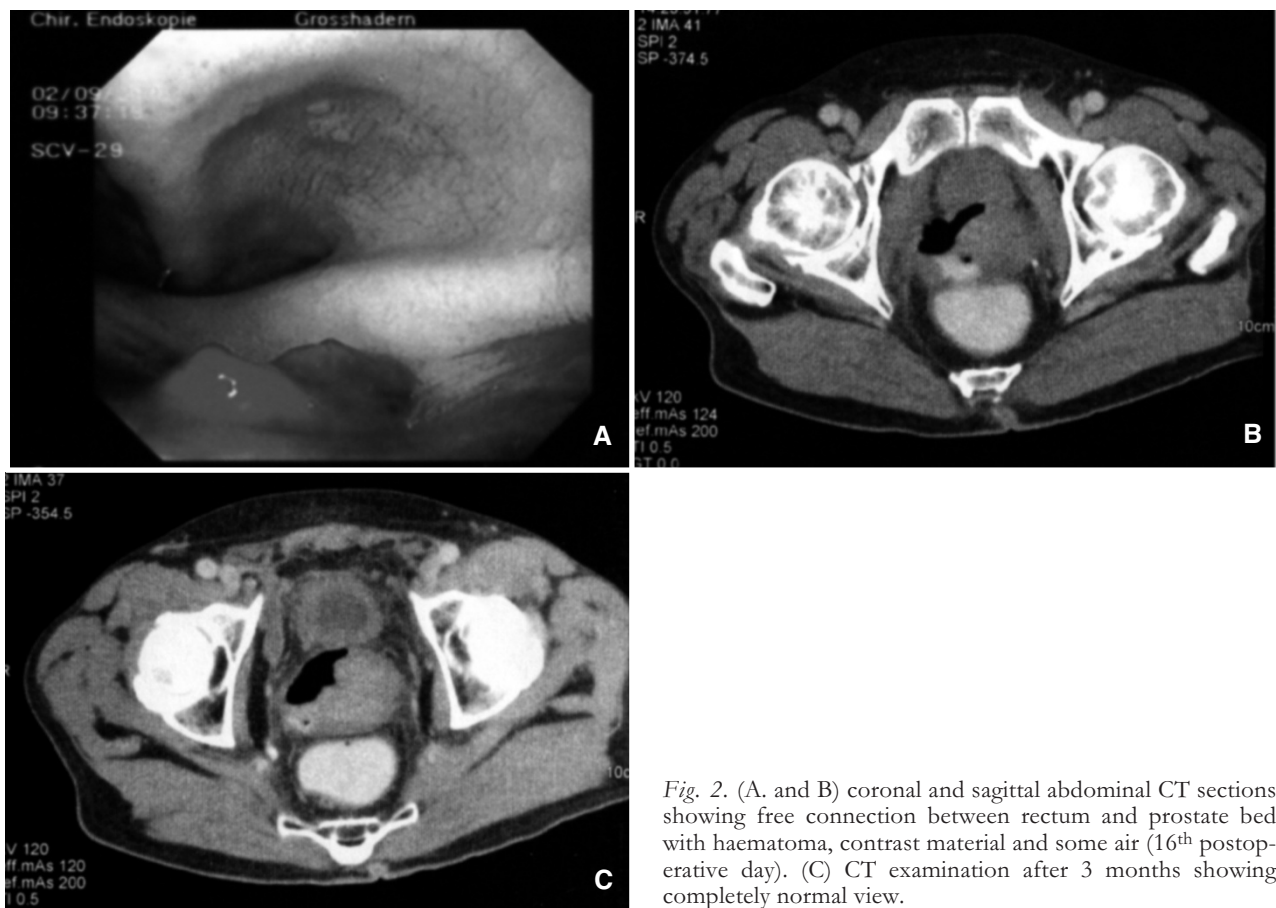
Fig. 2. (A. and B) coronal and sagittal abdominal CT sections showing free connection between rectum and prostate bed with haematoma, contrast material and some air (16 th postoperative day). (C) CT examination after 3 months showing completely normal view.

Although practiced in the beginning of open retro-pubic prostatectomy, most laparoscopic groups, including ours, leave the urethra intact during most of the dissection. Instead, the plane between the seminal vesicles, prostate, and rectum is developed, progressing from the base of the prostate as close as possible to the apex. It is during this dissection that most iatrogenic rectal injuries occur [2]. Most of these injuries are visually identified intraoperatively and commonly repaired in a 2-layer suture with or without interposition of omentum/fat be-