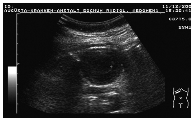
Fig. 1. Ultrasound of the gallbladder consistent with cholecystitis. Additionally sludge in the lumen (blue marks) and a light retention of effusion around the gallbladder was noted.

Renal Cell Carcinoma (RCC) is a rare tumour accounting for 3 % of all adult malignancies. It has a high